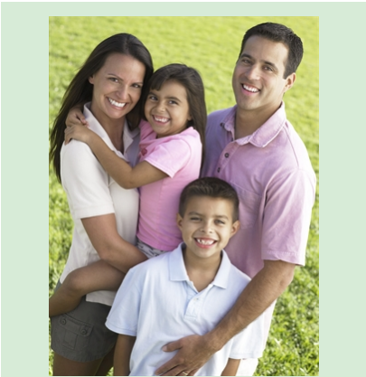
Regularly reviewing your life insurance can help it keep pace with your changing needs, and your financial and family obligations.